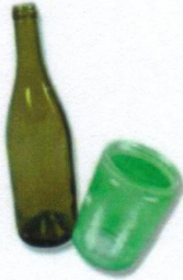
All Glass Bottles and Jars