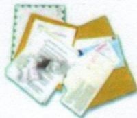
Mail & Envelopes