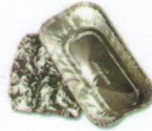
Clean Aluminum Foil, Foil Trays