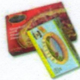
Paper or Frozen Food Boxes