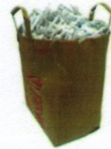
Bagged Shredded Paper