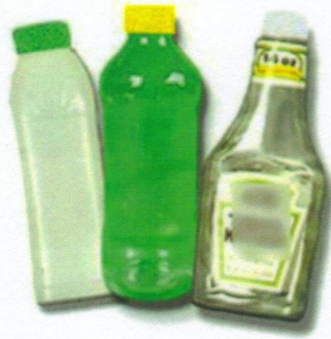
All Plastic Bottles and Jars