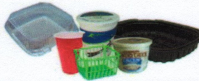
Clean Plastic Food Packaging (Dispose of major food items—some residue is ok. No compostable plastic, plastic film, bags or utensils)