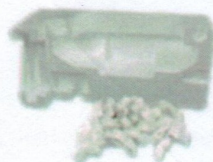
Styrofoam (Clean packaging foam only. Bag "peanuts" separately in clear bags, if possible)