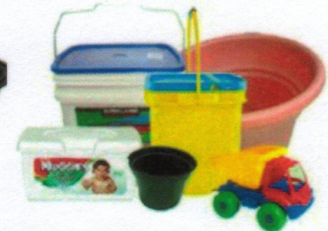
Plastic Buckets, Tubs, Pots and Toys*