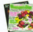
Magazines and Catalogs