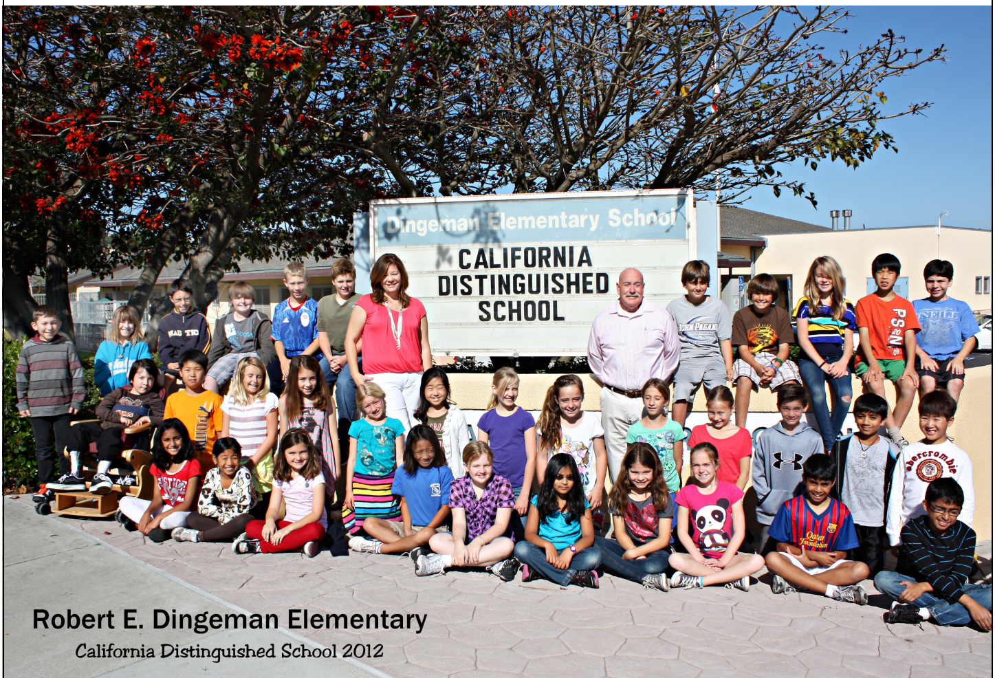
Robert E. Dingeman Elementary California Distinguished School 2012